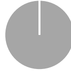
2. Taxonomy alignment of investments excluding sovereign bonds

■ Taxonomy-aligned (0%) ■ Other investments (100%)